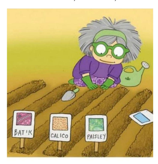
A quilter's garden