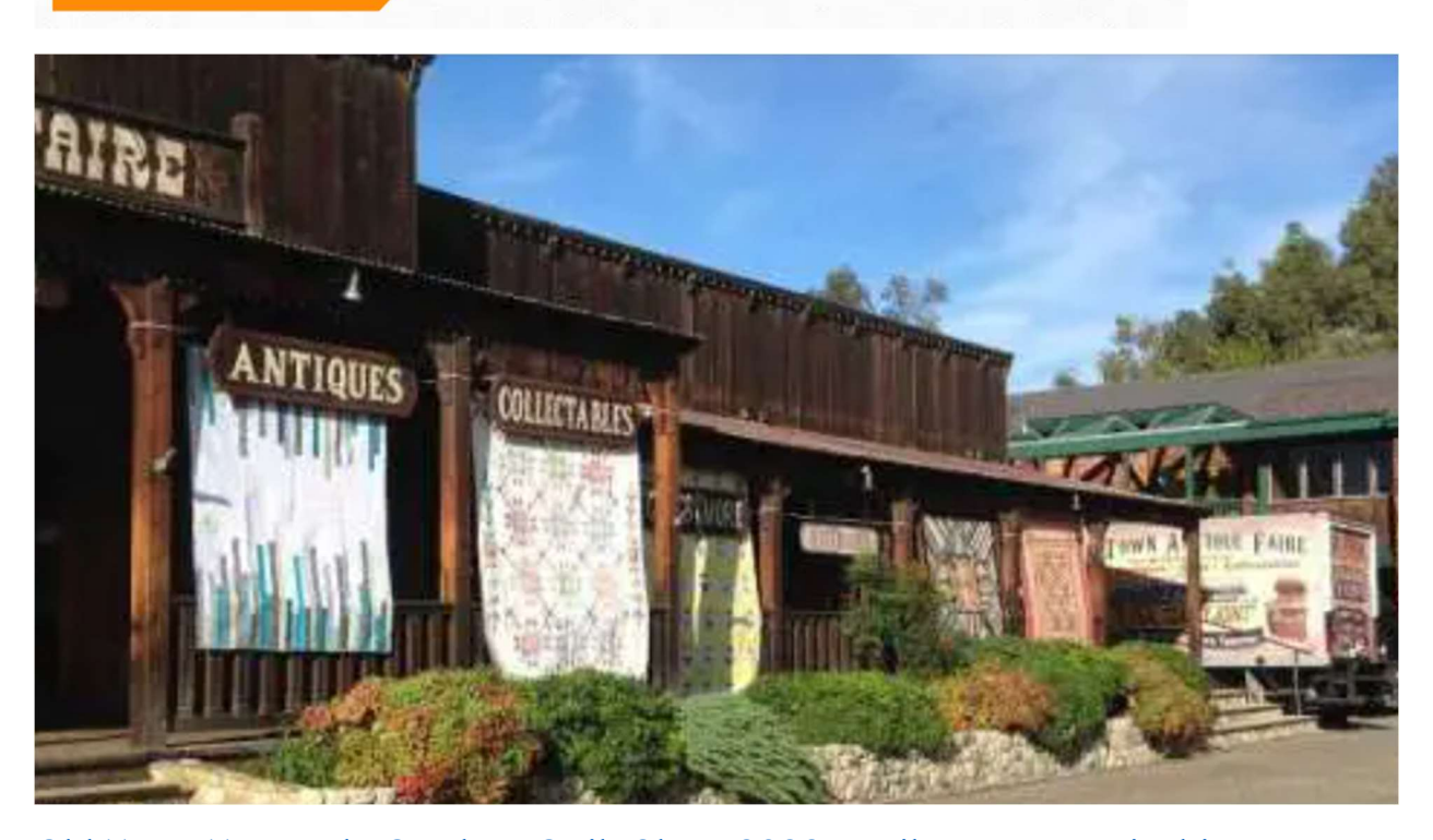
Old Town Temecula Outdoor Quilt Show 2023, a Fiber Arts Festival in... <u>(festivalnet.com)</u>