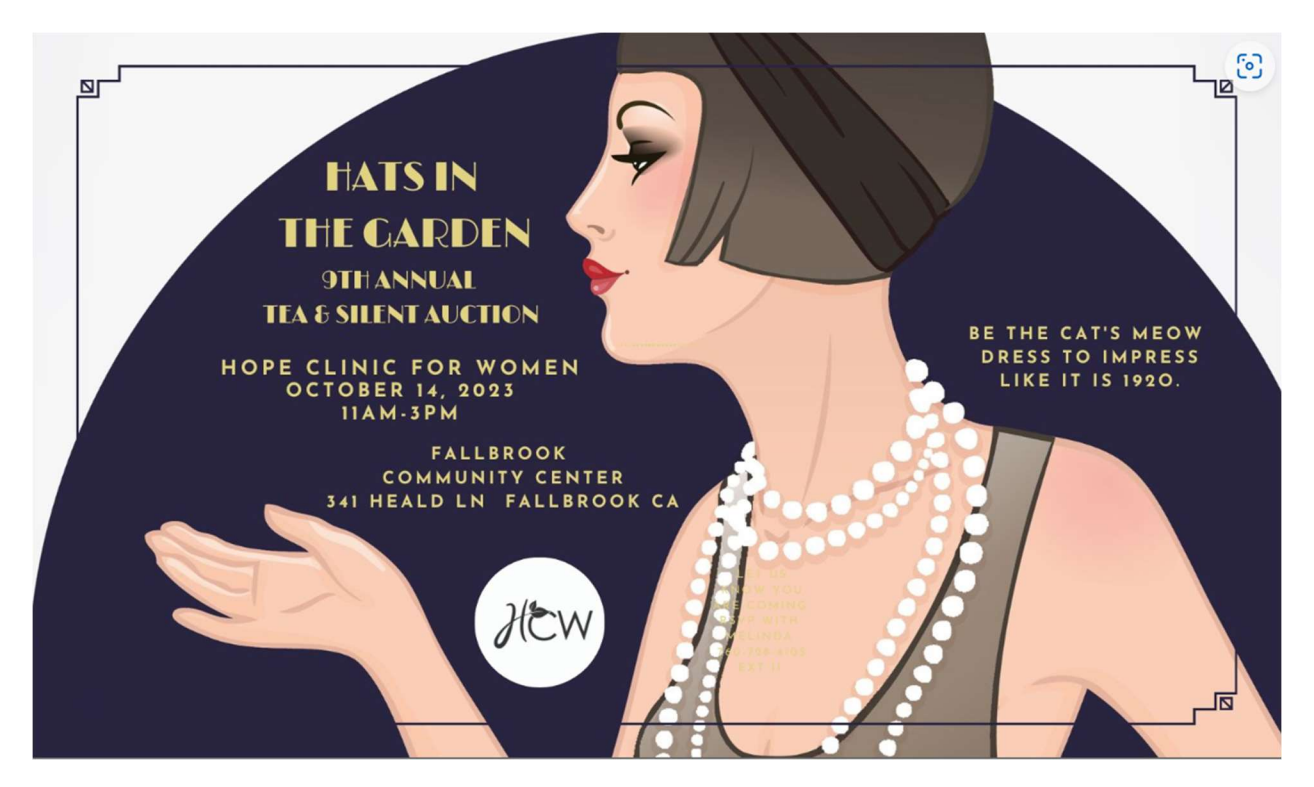
Save the Date - October 14, 2023 for this year's Tea and Auction!

Hats in the Garden's Roaring Twenties Tea and Silent Auction will be hosted on October 14, 2023.