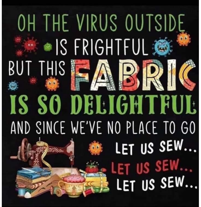
(attribution: unknown) ...and "show" as well.