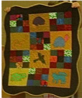
By Connie Follstad