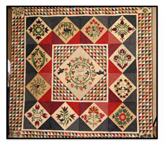
Our breathtaking 2015-16 Opportunity Quilt

It's the start of a new guild year and guess what that means? It's time again to pick up your tickets for the new "Words to Live By" Opportunity Quilt. Your 30 tickets will be ready for you to pick up at the July meeting. We hope that you will pay for the tickets when you pick them up. Since this quilt was so well received at the June meeting, we hope you might consider buying a few more tickets now or throughout the year so you'll have even more changes of being a winner of this extraordinary quilt. Good luck!