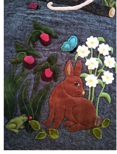
Workshop: Saturday February 4 from 9 a.m. to 3 p.m. "Needle Felted Fashions and Gift Items"

Fallbrook Public Utility District Boardroom Shirley will be showing us how to use wet and dry felting to add dimension and character to your wool quilts and clothing. Several important things to note: