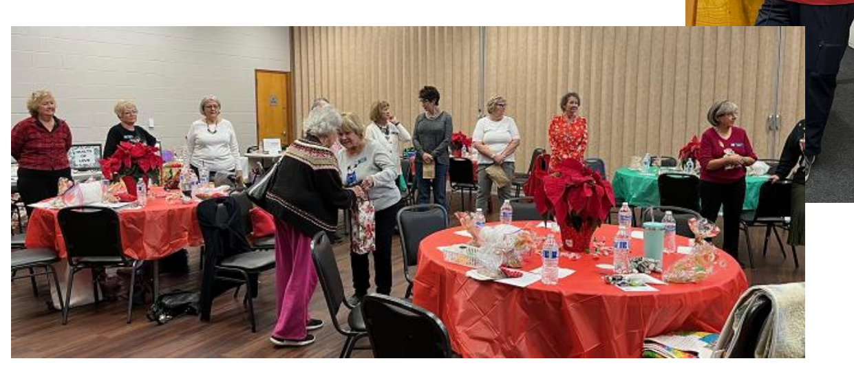
We had a great time at the holiday party in December