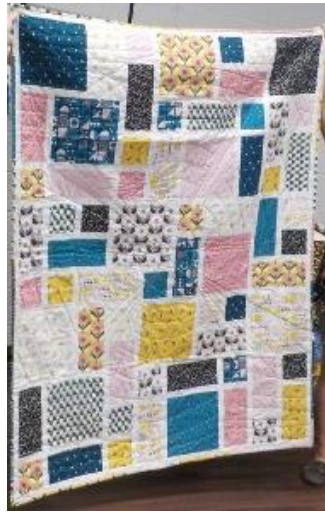
Sheryl Kaplan (both)