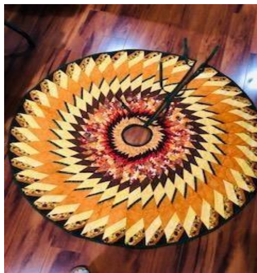
Holiday Tree Skirt – 50" round/reversible