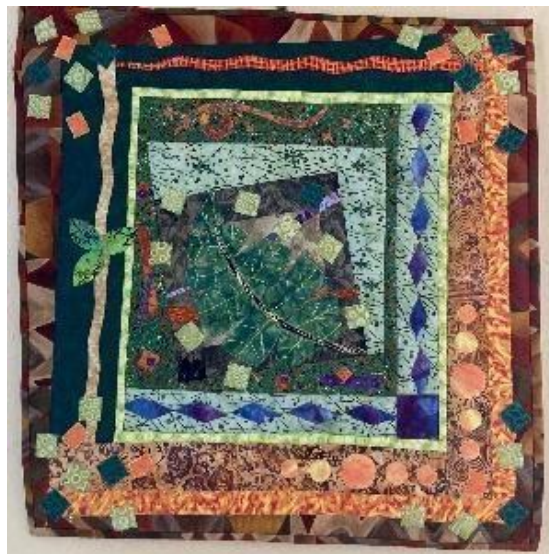
It Started With A Leaf – 23” x 23”