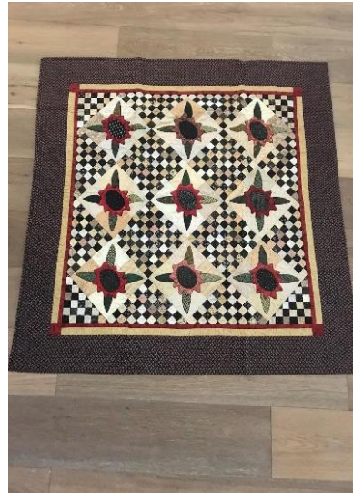
Flowers for All – 44” x 44”