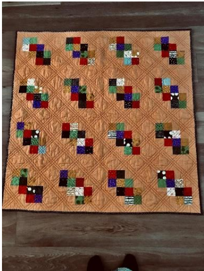
Pumpkin Delight – 46” x 46”