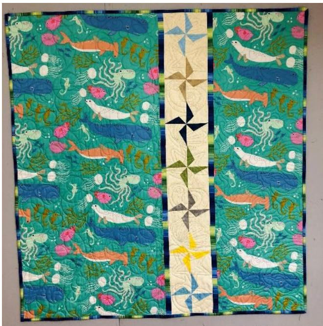
Day at the Sea – 41" x 43"