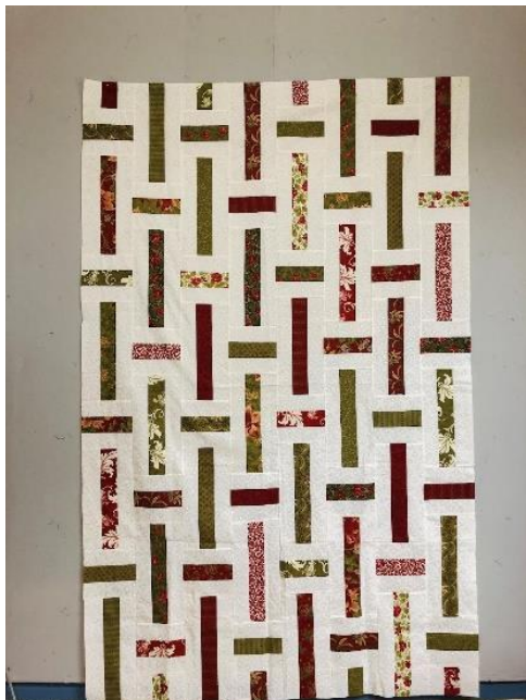
Christmas Lawn Chair – 47.5” x 75.5”