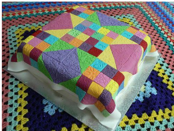
“Grandma’s Birthday Cake”