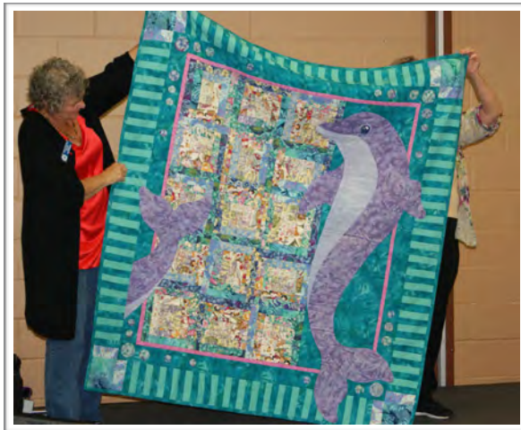
Cuteness and piano keys!