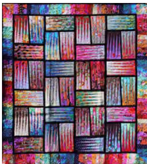
This is what we will be making!