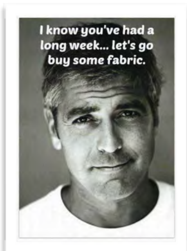
And who knows who might show up and take us shopping!