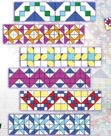
TABLE RUNNER PATTERN