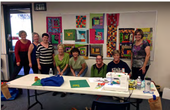
Workshop girls "improving" along!