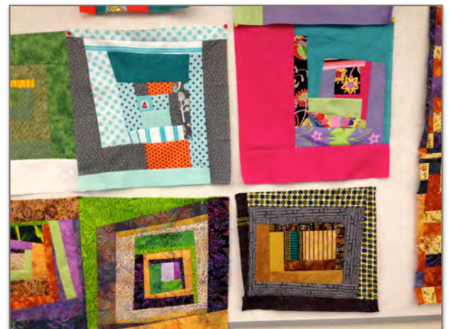
Grab some scraps, sew and voila!