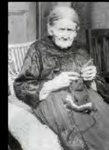
What our grandkids think we do.