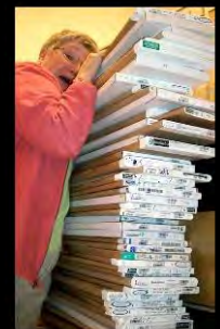
What we're actually doing.