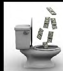
What our husbands think we're doing.