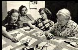
What Society thinks we do