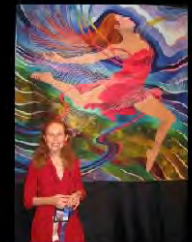
What we want to be doing