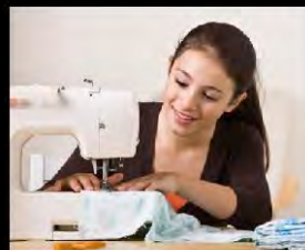
What we SHOULD be doing.