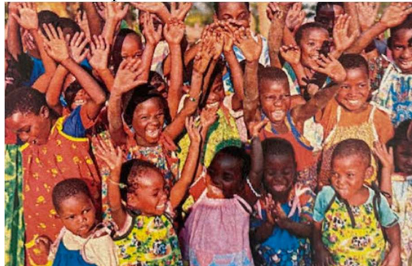
Photo below is from the last trip to Malawi. Look at those happy faces!