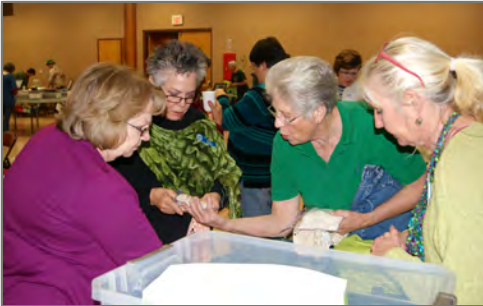
The admirin' of the green....