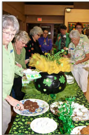
The eatin' of the green and we ate more than just salad!!!!!!