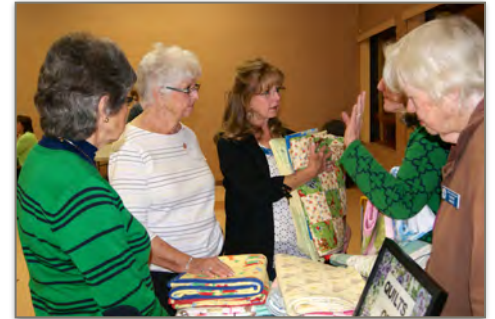
Quilts of Lovin' the green